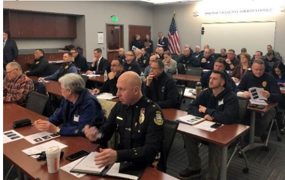
Figure 3.3 - 1 February 20, 2019 Municipal OEM Coordinator Kick-Off Meeting