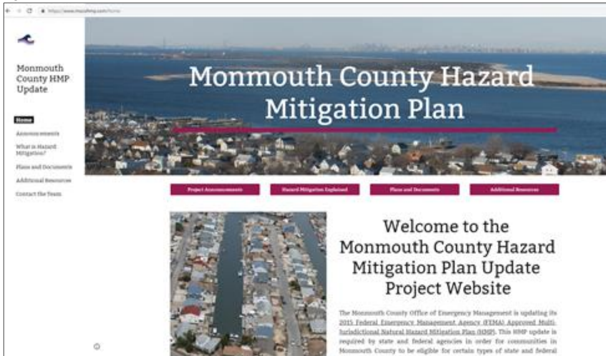
Figure 3.1 - 2 HMP Website Public Comment Section