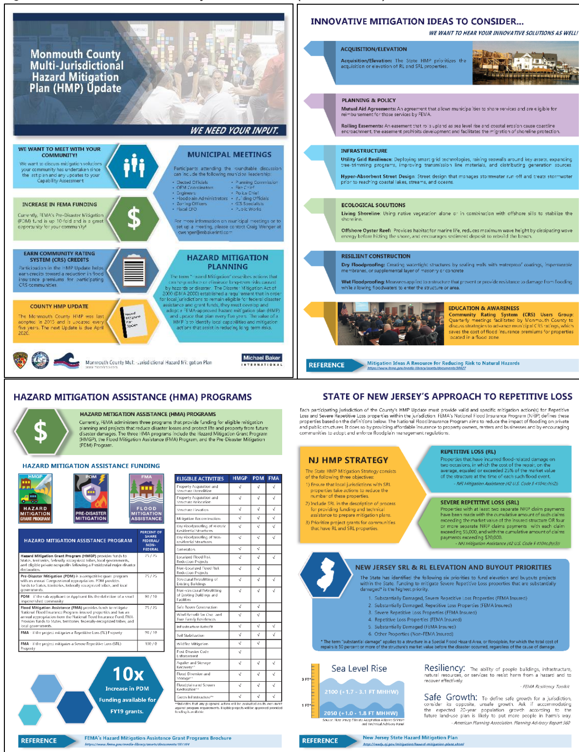
Figure 3.5 - 3 Monmouth County HMP Brochure (front and back)

Monmouth County HMP Brochure: Helps communities start brainstorming mitigation strategies that they want to address in plan by providing hazard mitigation funding assistance programs, the State's approach to repetitive loss, innovative mitigation ideas, and FEMA's resources to mitigate hazards.