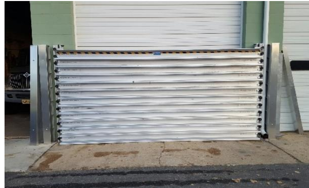
Community Action #42_4: HMGP-funded flood-proofed doors at Rumson's DPW building, which experienced 4 feet of water during Superstorm Sandy.