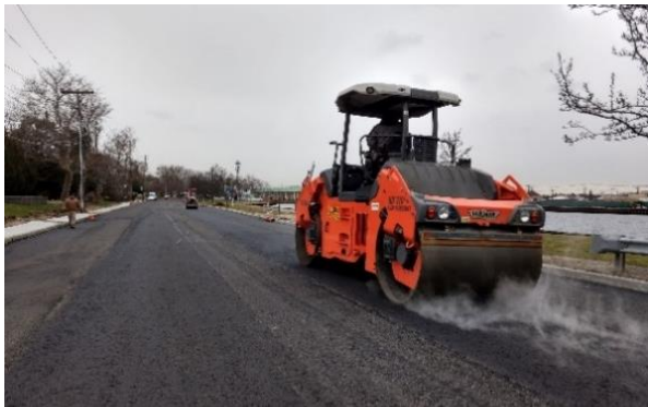
Community Action # 30-16: Road Elevation in Manasquan, NJ.

New to this plan is the integration of the State Mitigation Strategy, which requires jurisdictions with RL and SRL properties to reduce the number of those properties. Each municipality that has RL and/or SRL properties must have a mitigation action that describes how they will mitigate the properties. During the municipal meetings, the Project Team discussed which properties are RL or SRL with local officials, along with the status of those properties and ideas on how to mitigate the RL and/or SRL properties. Since RL/SRL data is sensitive information and not available to the public, only the State and the County have access to the RL/SRL data.