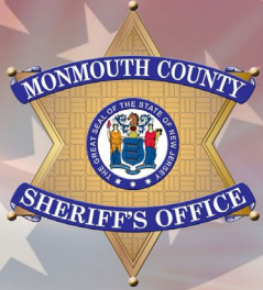
SHAUN GOLDEN SHERIFF

These types of threats are taken very seriously and will not be tolerated, to ensure the safety of the people who live and work in Monmouth County. A total of two phone calls were received at the Monmouth County Social Services offices located at the Human Services building in Freehold. The first call occurred on October 21 and