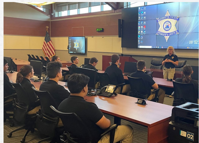
ACADEMY OF LAW AND PUBLIC SAFETY