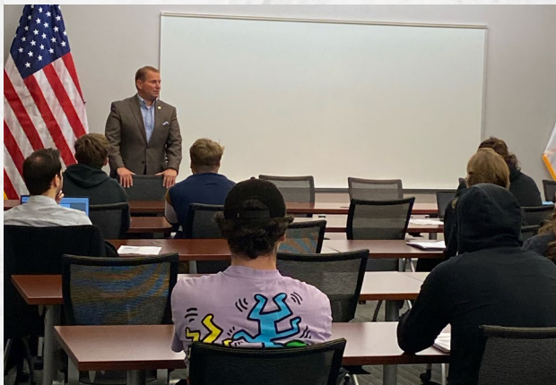
BROOKDALE COMMUNITY COLLEGE