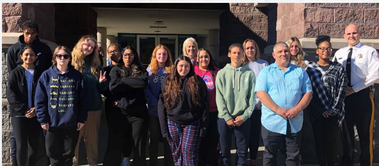
MONMOUTH REGIONAL HIGH SCHOOL