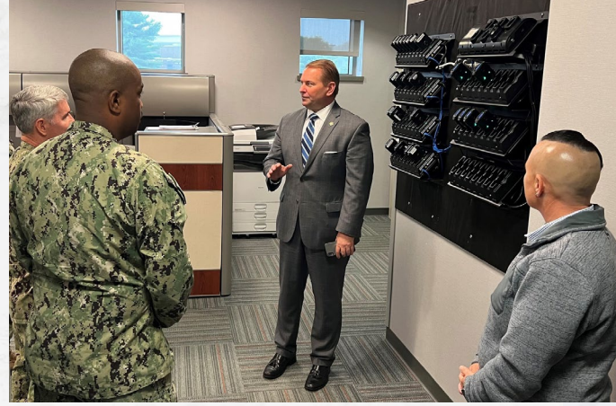
NAVAL WEAPONS STATION EARLE