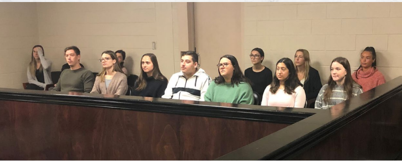
GEORGIAN COURT COLLEGE