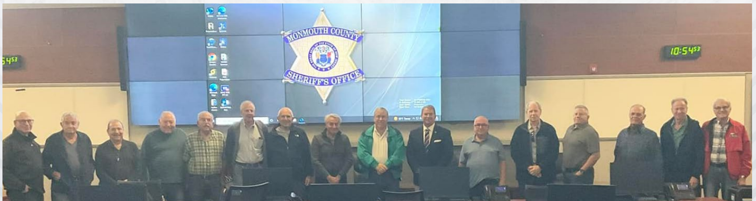
FOUR SEASONS MANALAPAN MENS CLUB