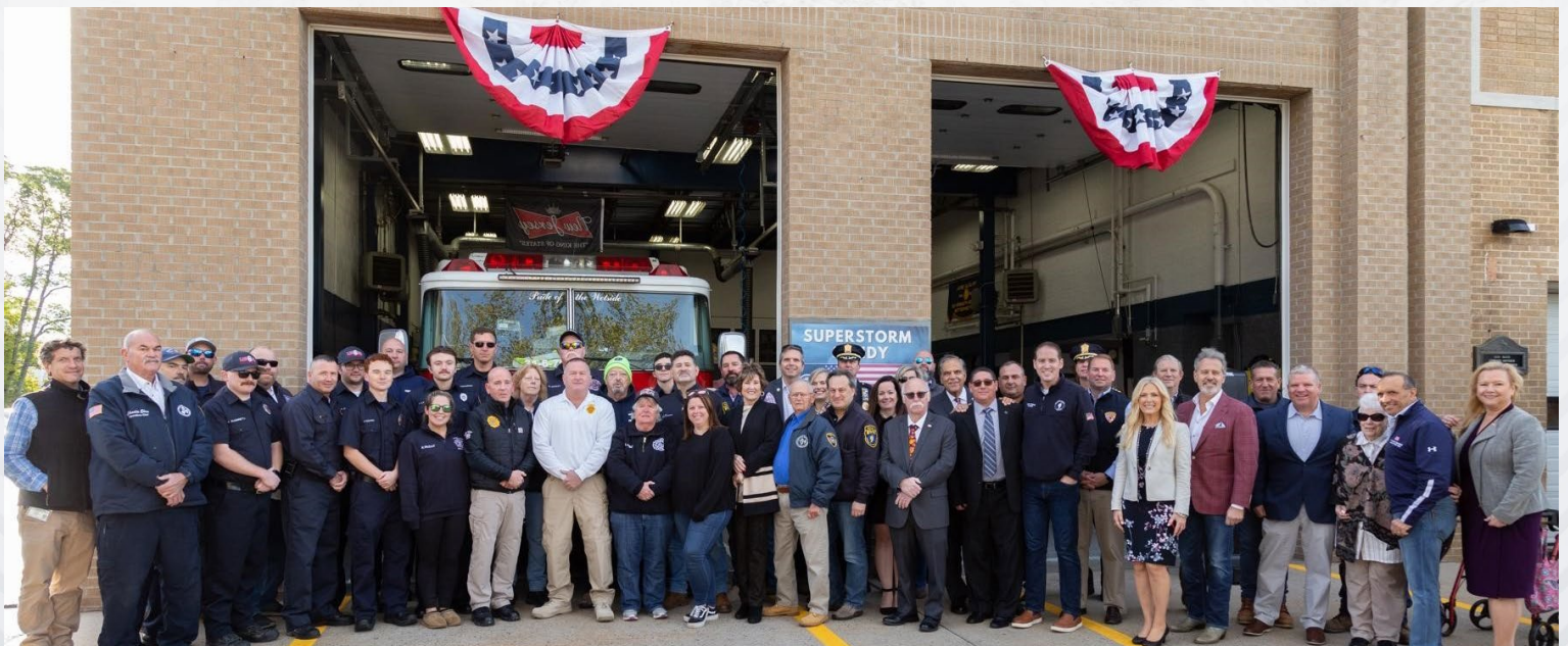
Remembering Superstorm Sandy 10 years later at the Fort Monmouth Fire House in Middletown, NJ.